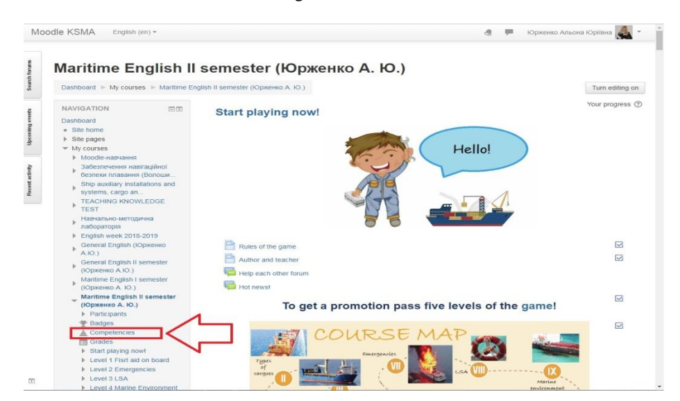
Fig. 3. The position of Competency Framework in LMS MOODLE "Maritime English" ecourse.

To study Maritime English competency framework according to STCW was created in LMS MOODLE and Maritime English is studied.