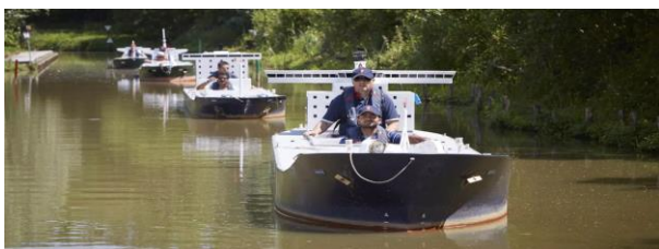
Figure 2. Scaled models of ships