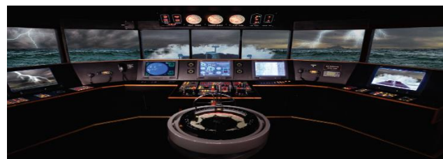
Figure 3. Bridge simulator Navi Trainer 5000

Conclusions. After comparing of three different methods: real life practical training, virtual simulator and combined physical model of scaled ships with bridge simulator, give understanding that the last one the most effective by author's opinion. Combined method give possibility to explore and improve skills on high level without danger. Combination of IT technologies and physical model allows seeing whole picture of process, shows all variables and high current data by indicators of bridge simulator and equipment on scaled ships without additional risks or unknown