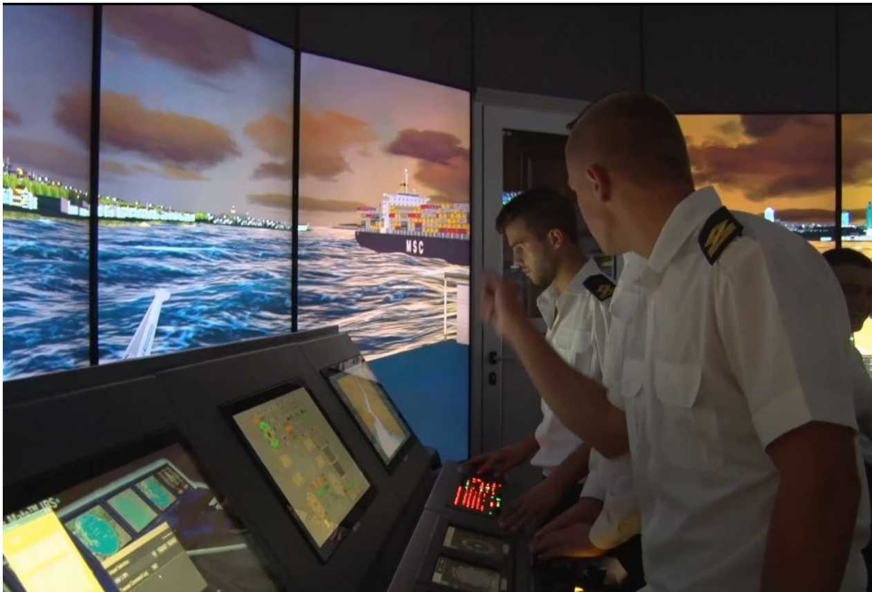
Fig. 1 – Full mission DP vessel simulator

Fig. 1 shows a fragment of the work of the Academy's cadets on full mission DP vessel simulator [7–8].